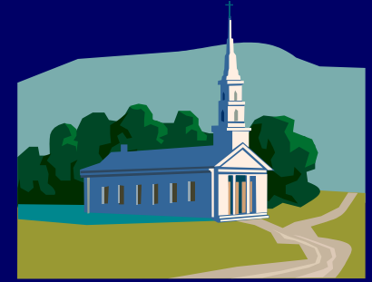
Assembly of God